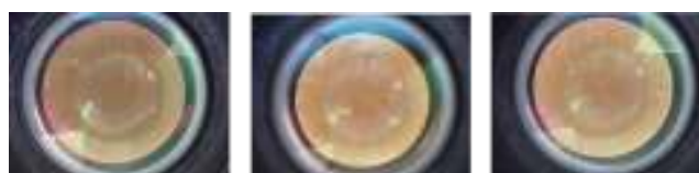
Figure 1. Optical images of the prepared films (magnification ×70): a) Pure gelatin film (left), Gelatin-Glycerol film (middle) and Gelatin-Glycerol-Tea (right)

Dry thin films were used for the optical measurements, and the results of the optical spectroscopy are shown in Figure 1.