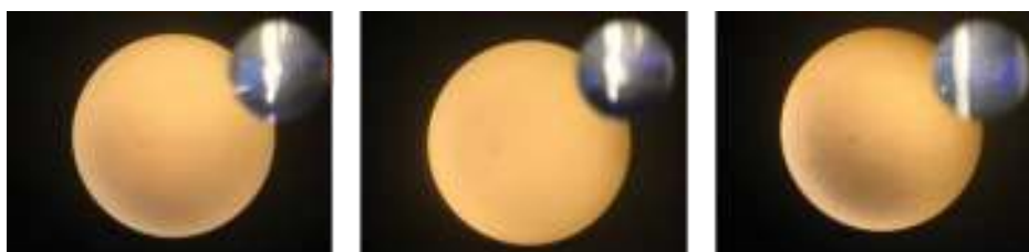
Figure 2. The smoothness and transparency (top right inserts) of the prepared films (magnification \times 20 )