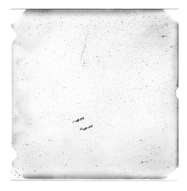
Fig. 4 Scanned photographic plate (from the very early datasets)

EURO-VO provides some tools, which are going to be used together with the standard software (SQL, JAVA, Perl etc.) to build an appropriate database. We expect to generate around five Tbyte of data in the first instance. Handling will be achieved using the Linux Software RAID array with Linux Volume Manager.