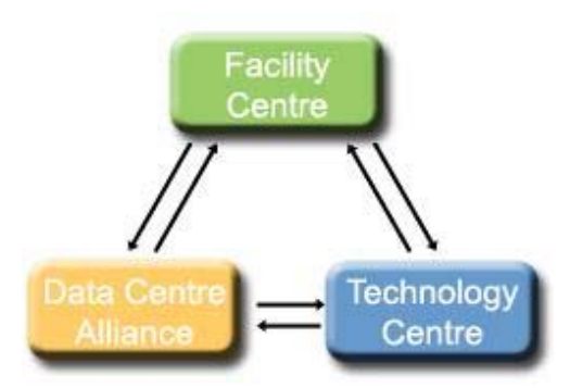
Fig.2 Organization of European Virtual Observatory

EuroVO is organized in three main parts as shown in Fig 2.