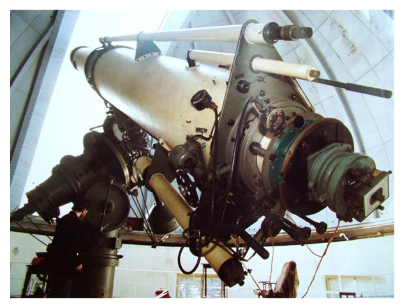
Fig. 3 Zeiss refractor

Various photo plates were used during around sixty years: Kodak (103aO, 2aO, 103aJ, 103aF), Ferrania Pancro anti-halo, Agfa Astro-Platten, Peruts Emulsion, Gevaert Super Chromosa, ORWO ZU 2 and ZU 21, Ilford etc. Also those plates were of different format, and variety of objects were observed.