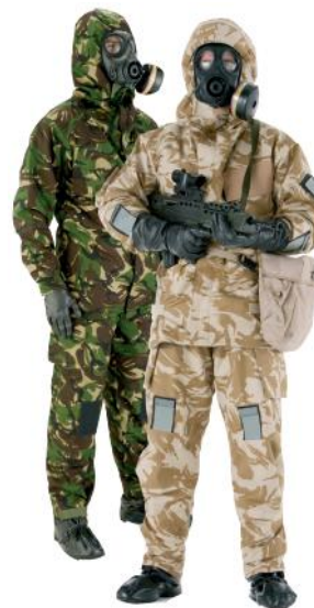
Figure 1 - NBC clothing including Saratoga™ suit

The suit consists of a coat and trousers (figure 1). The coat features a full-length zippered opening covered by single protective flap, an integrated hood, hook, and pile sleeve closures. The trousers feature adjustable waist tabs, suspenders, and closures on the lower outside section of each leg. The suit can be worn over the duty uniform or undergarments. The suit is wearable in all environments and conditions and is compatible with the gloves, boots and mask. It is not degraded by fresh or salt water and is launderable. The outside layer of material is cotton rip stop that has been corpel treated.