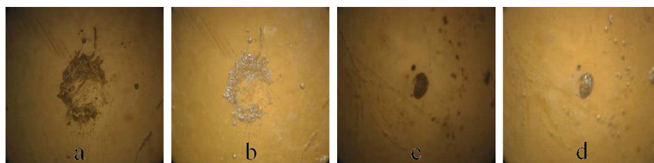
Fig. 2. Damages (100 \times ) on (a), (b) semi-hard and (c), (d) hard lens.