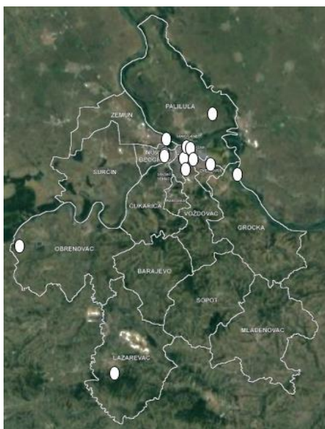
Figure 1. The map of the Belgrade district with monitoring stations locations

tain. In a metropolitan Belgrade area, a denser network of in-situ air quality control measuring stations should have been established. Air monitoring stations were classified per type (source of pollution), as background (eight), traffic (three), and industrial (two); and per residential zone, as urban (eight), suburban (four), and rural (one). In fig. 1, the map of the Belgrade district with the spatial location of the air quality monitoring stations is presented. The diurnal means of PM_{2.5} concentrations were derived for each station by averaging hourly measurements. Furthermore, a city-specific diurnal mean of PM_{2.5} concentrations was derived for the Belgrade district by averaging all diurnal mean data from all air monitoring stations. Further, those values were assumed to represent the average public exposure [19, 20].