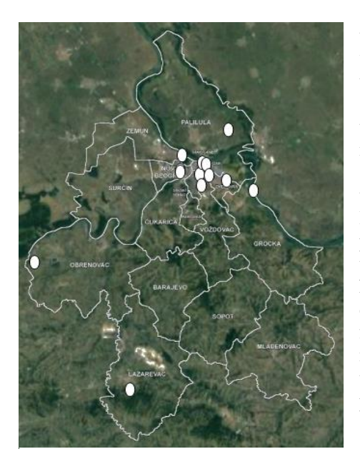
Figure 1. The map of the Belgrade district with monitoring stations locations